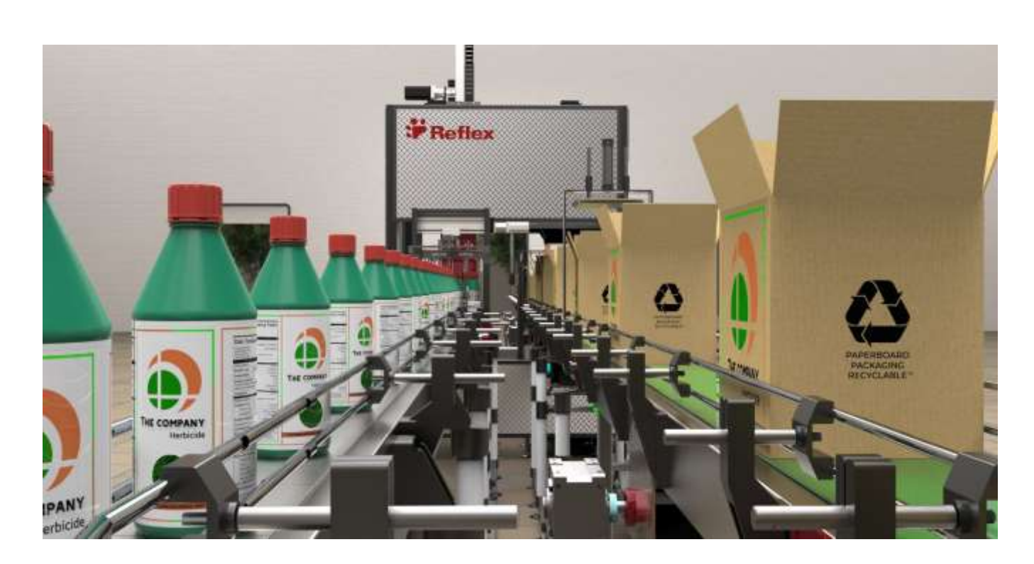
Note: - The information contained herein is subject to change without notice. Customers are advised to verify the latest specifications from our representative.